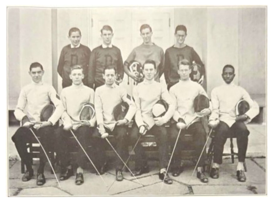
Drew University fencing team, circa 1932.