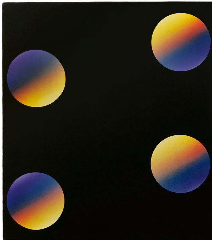
Adam Henry, Untitled (4sp4dm) , 2017, synthetic polymers on linen, 16 x 14 inches