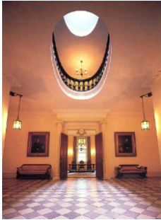
Mead hall Interior before the fire